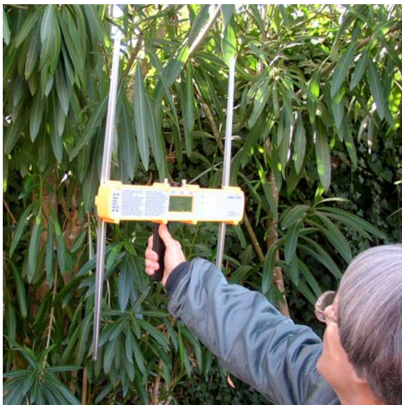
Figure 2. Operating Position for all Frequencies.

ALWAYS set the antenna blades as shown in Figure 2.