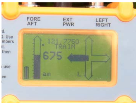
Figure 3. L-Per® Operating Screen in the DF Mode.

Figure 3 shows the operating screen in DF mode with the various condition indicators.